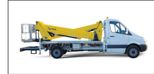
Low travel height