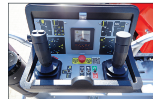
Easy to use full proportional (FPC) CANbus controls with display