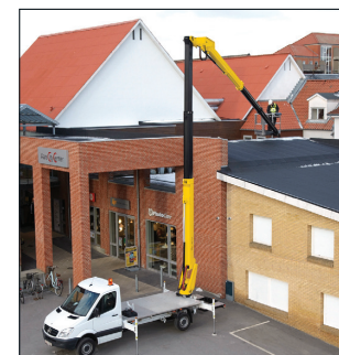
The ability to work over rooftops to access difficult to reach areas is aided by a flat bottomed basket