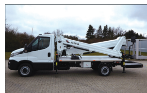
Also available on 3.5T GVW Iveco Daily 35S