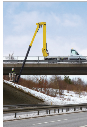
Ability to access below ground