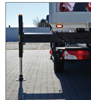
Compact H-frame outriggers

The photographs in this brochure are for promotional purposes only. Specifications are subject to change without notice.